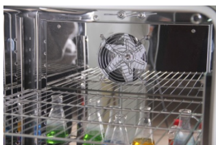
Motor Fan for Forced Air Circulations