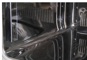
Coved Corner for Easy Cleaning